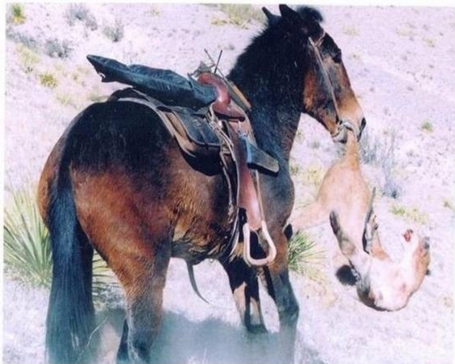
the cat was still alive here and trying to fight back